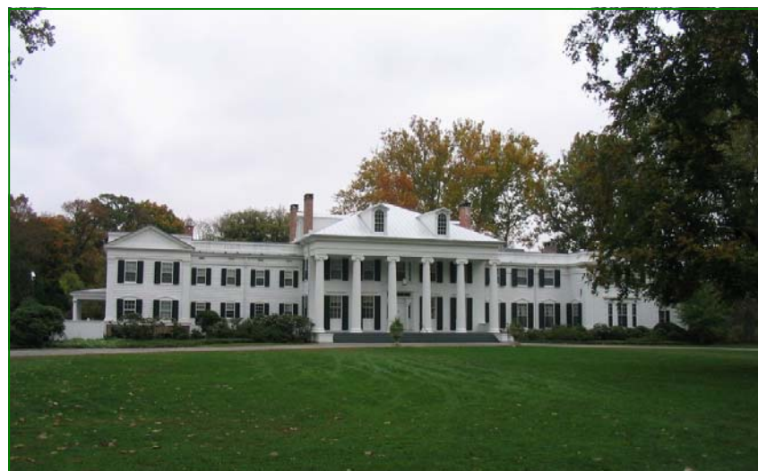
Drumthwacket, seen here in the fall, is decorated for the holidays by New Jersey garden clubs.

The Westminster Choir College of Rider University is a residential college of music in Princeton. There is an extensive program of December performances including: Cool Yule Jazz; Kindle the Tapers: A Concert for Chanukah; and Handbell Holiday Concert. For more information go to www.rider.edu or call 609-921-2663.