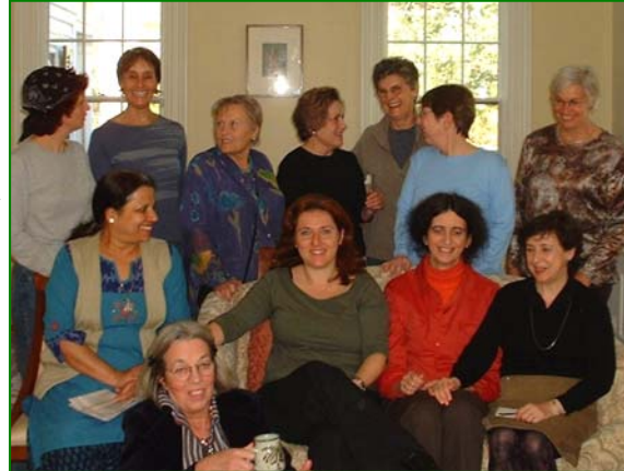
At a recent gathering of the English conversation group.

Where can I buy cotton thread to sew on a button?