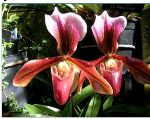
Two orchids side by side at Longwood Gardens

By car it takes a little more than an hour to drive to Brandywine. Unique wineries, antique shops, and some interesting estates and museums are all relatively close together.