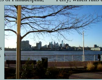
Philadelphia skyline from Camden Aquarium

twelve-minute ferry ride between Camden and Penn's Landing, providing a scenic view of the Philadelphia skyline as you sail across the Delaware River to the Philadelphia waterfront where there is a variety of fine restaurants and attractions: see their website at www.riverlinkferry.org.