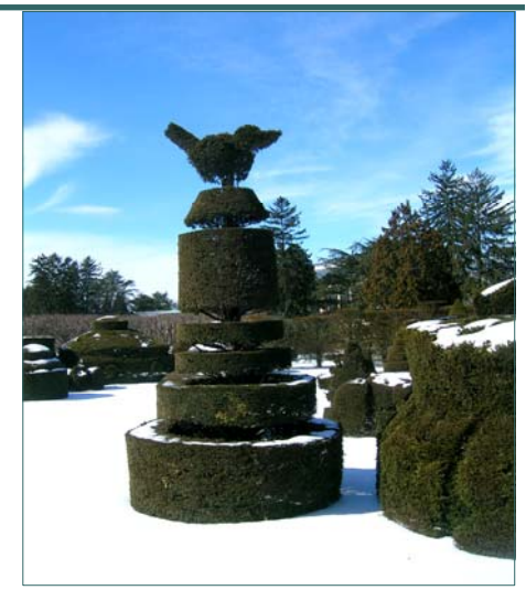
Hedge sculpture in the snow at Longwood Gardens

In its February/March edition, The Discerning Traveler writes: "This is one of the most interesting places to stay that we have come across in our travels. The historic village is comprised of eleven buildings