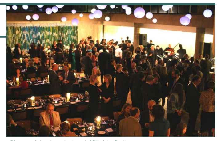
Dinner and dancing at last year's Midwinter Party

This is an evening when the entire Institute community comes together to enjoy great food, drink, live music, and dancing. This event requires registration and begins at 7:00 p.m. and lasts until 12:00 a.m. The Dining Hall is dressed in its finest linens and table-