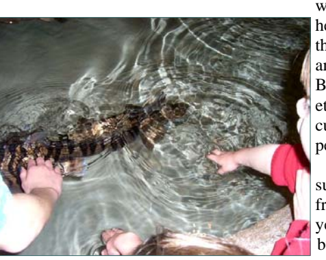
How about petting a shark?

Rather to our amusement it was deemed too cold on this recent December visit for the penguins to be outside and so we did not see them. Perhaps