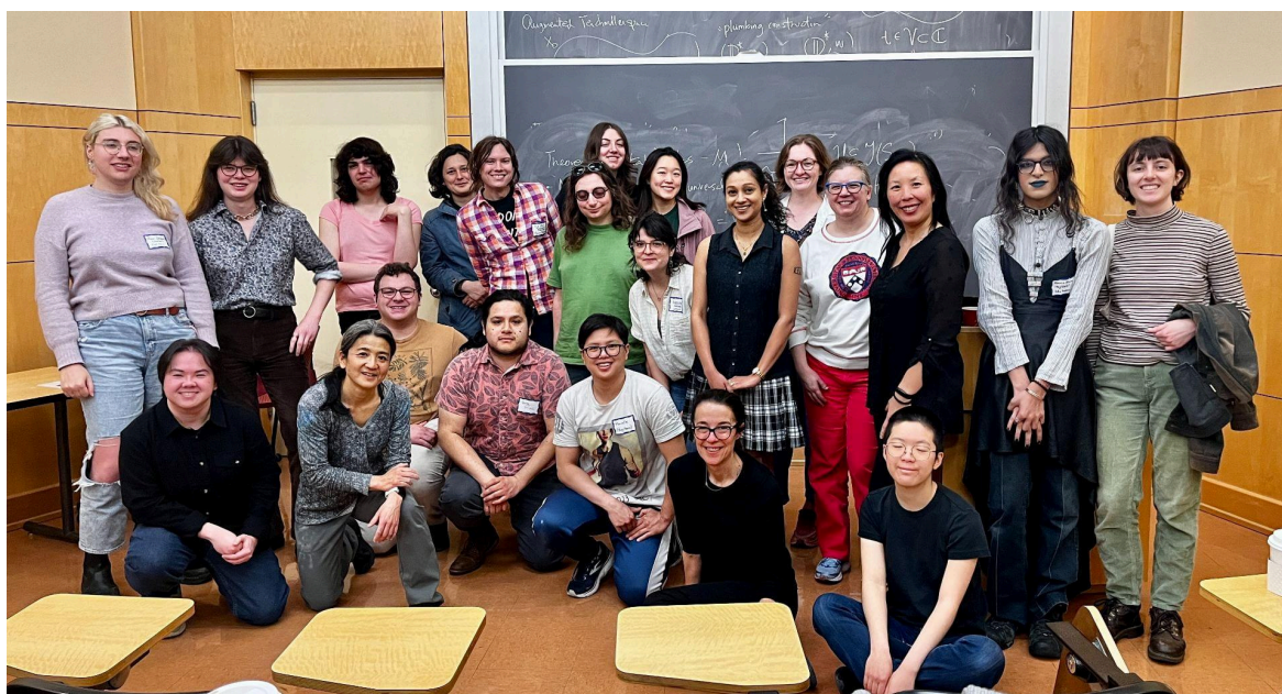
GeMTRAK group photo